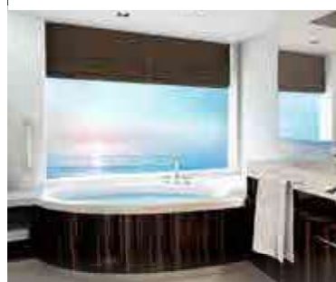
The Haven Family Villa bathroom