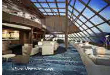
The Haven Observation Lounge